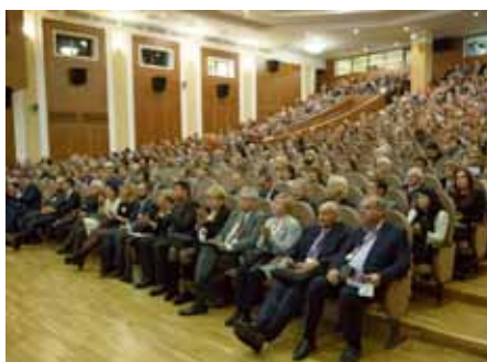
Interdisciplinary audience at the Conference.

On the 30th of October 2017 the second Moscow international Conference “Interdisciplinary approaches to the mental health of person and society” took place in Moscow State University. The Conference united specialists from different fields of knowledge to speak on the issue of mental health: psychiatrists, psychologists, biologists, jour-