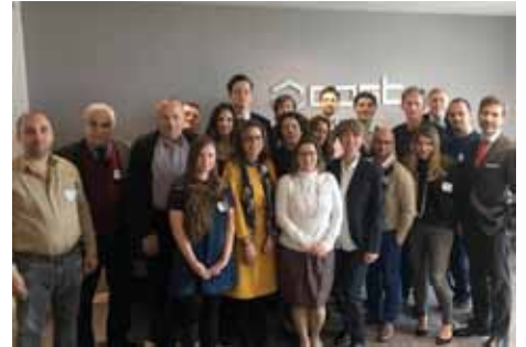
The multinational Action Management Committee at their inaugural meeting in Brussels on 23rd October 2017.

To this end, the EU under its Horizon 2020 umbrella has just launched a new four year European Cooperation in Science and Technology (COST) Action Programme (CA 16207), led by members of the WPA Anxiety and Obsessive Compulsive Disorders Section, to advance networked interdisciplinary research into problematic internet usage across Europe and beyond. The first steps will be to reach consensus on the reliable definition of the problem, devise age-appropriate assessment instruments to measure its severity, plan studies to clarify its clinical course and impact on health and quality of life as well as to clarify the underpinning brain-based mechanisms to support the development of screening biomarkers to identify those who are vulnerable before the problematic use becomes too entrenched and ultimately to identify targets to guide the development of new and effective interventions. The Action welcomes research-active scientists