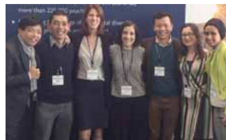
ECP Section Board Members at WPA Congress, Berlin 2017.

visits and a pub crawl. The new elected board has eight members, each representing a region of the world (Western Europe, Eastern Europe, North Africa and Middle East, Asia, South Africa, North America, South America and Australia and New Zealand). The ECP Section will continue working to support psychiatric trainees and early career psychiatrists across the world, providing them further opportunities for professional development.