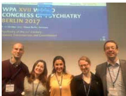
Participants of EFPT Symposium, WPA World Congress Berlin Oct 2017.

EFPT was delighted to participate in the World Congress of Psychiatry in Berlin, with a range of contributions to the scientific programme. This included a collaborative symposium involving several early career psychiatrists' organisations, encompassing the WPA's own Early Career Psychiatrists' Section, amongst others. EFPT is also pleased to have published its first ever joint statement with the WPA on the ‘Mental Health of Psychiatric Trainees who Migrate: Supporting Adjustment and Growth’, which is available here: http://www.wpanet.org/detail.php?section_id=7&content_id=2050 .